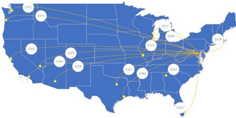
Sample airfares to BWI ( larger image )