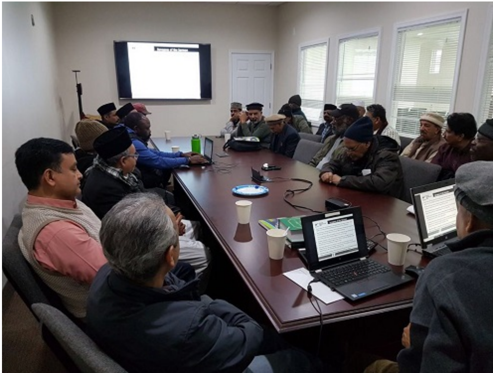
Baltimore Majlis' general meeting held on Feb. 4, 2018