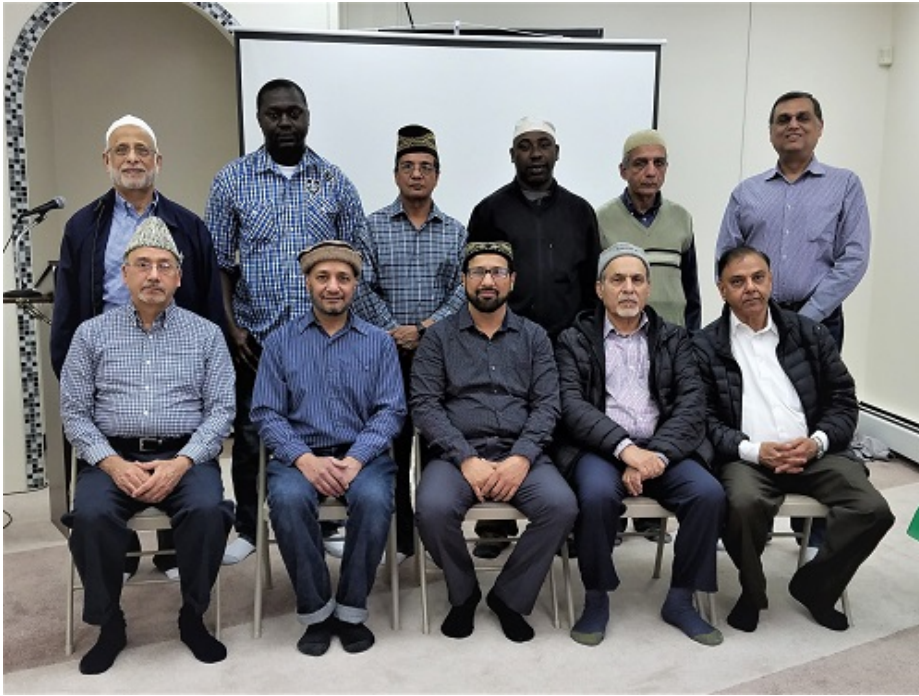
Group photo at 2017 Syracuse local Ijtima