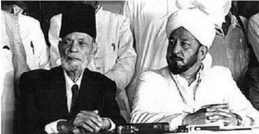
A historic photo: Hazrat Chaudhry Zafrullah Khan with Hazrat Mirza Tahir Ahmad

president of the Ahmadiyya Student Association at the time—were going to attend the prize distribution ceremony. We were very excited that after the Khalifah of the time, two of the most important and well-respected dignitaries of the Jama'at were going to attend the function. It was once-in-a-lifetime opportunity and therefore we were exceedingly thrilled and were expecting lively and extensive speeches by them. Hazrat Chaudhry Zafrullah Khan was at his advanced age and had an exceptionally outstanding reputation and persona at the time; so we were thrilled to be able to listen to his numerous experiences and insightful advice.